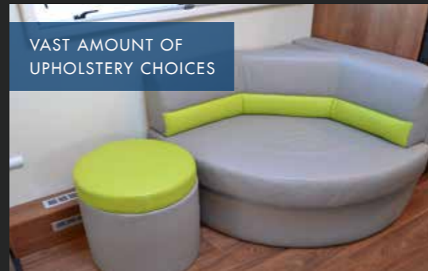
CUSTOM BUILT ENTERTAINMENT UNIT