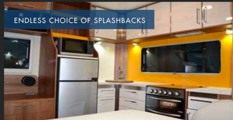
ENDLESS CHOICE OF SPLASHBACKS