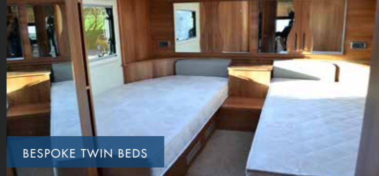
BESPOKE TWIN BEDS

Every Celtic Rambler is built bespoke to your requirements. Our own craftspeople assemble the tourer by hand, ensuring the very highest quality and attention to detail. You can choose from a range of colour schemes and materials and there is a sumptuous wealth of extras available to further enhance your touring experience, these include awnings, home cinema set-ups, air conditioning, reversing cameras and auto-levelling systems.