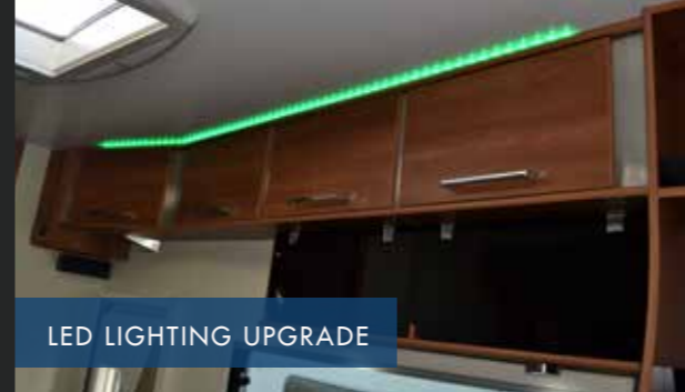
LED LIGHTING UPGRADE